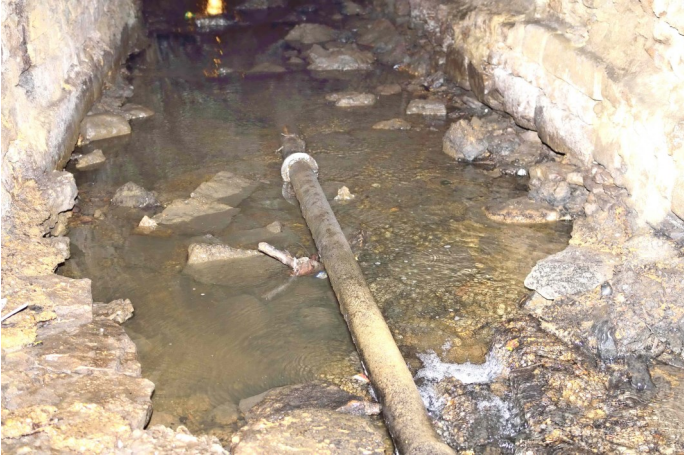
Light at the end?

though shallow, was flowing over a jumble of ankle-breaking rock slabs of all shapes and sizes randomly placed. Fiercely suppressing thoughts of returning to the real world I supported myself by holding onto the mossy wall to keep my balance. Soon the roof was higher and I could stand upright but maintaining balance was still difficult - I feared dropping the camera and flash into the water. I saw that Roger was calmly making written observations and I was left to myself to decide what to photograph, so I chose to record the base ("shelf") of the three-metre wide tunnel, the varied construction of the roof and the various entry points for water. I drunkenly walked a distance of 73 metres until I encountered a severe drop in roof height and could proceed no further although Roger went on – he managed to get through the low tunnel under St Nicolas' church and a little way up Stert Street while I less than bravely started on a lonely staggering walk back to my favourite manhole. I had photographed Roger at work, the culvert's shelf and several of the strange inlets on the west side. That was enough for posterity, surely.