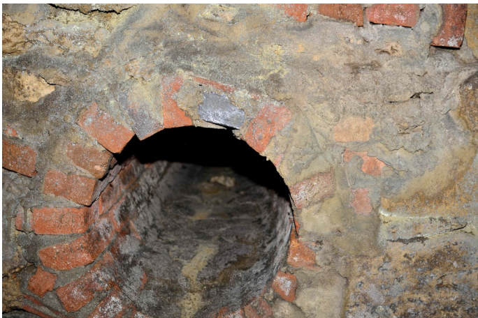
Did I hear — rats?

During August last year the message reached me via email. Would I like to walk (perhaps crawl?) along a wet, dark and damp tunnel beneath some of Abingdon's most important buildings and the pavement of Stert Street? Why do it? Would not staying at home reading the Archaeological Times be a more sensible thing to do for an