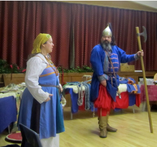
The Bifrost Guard—less rape and pillage, more fashion show

I am writing this in January. By the time you read it in March, the Christmas festivities will be a distant memory; so too, we hope, the floods which are currently afflicting the Thames valley.