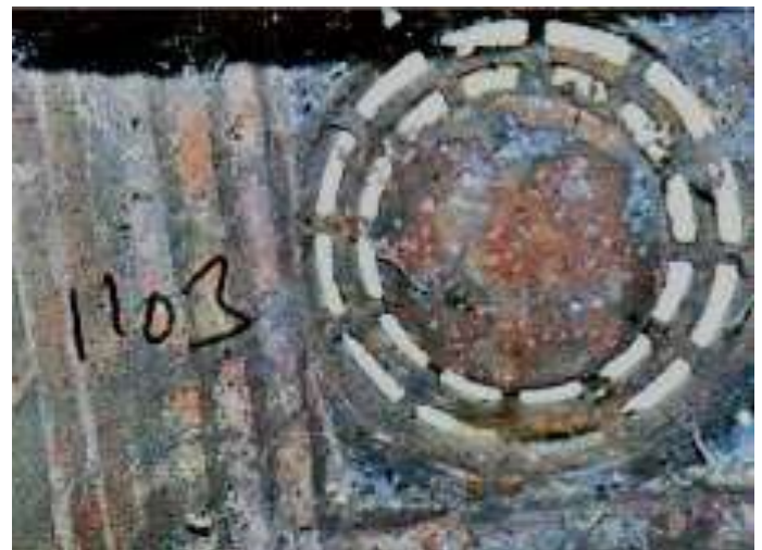
My favourite manhole