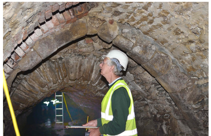
My expert companion

As soon as I started walking I got into trouble. The roof was so low that bending down all I could see was the visor of my hard-hat and the water – too soon to turn back. Additionally I started stumbling quite badly as the water,