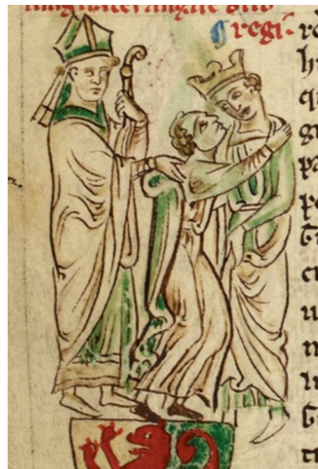
St Edmund forces a baron to make friends with King Henry III, who doesn't seem enthusiastic.