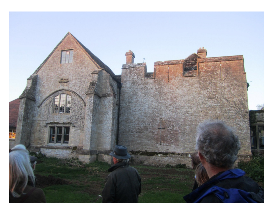
Bampton Castle, romantic in the evening light

As we came out, switching off the lights and closing the door behind us, the weather had cleared a little and, with the maps and photos that Sarah had given us, in spite of her mentioning a manor and a castle, we thought we were going to walk the streets and pathways of Bampton and learn more about its history. We took a lane, then a path, crossed