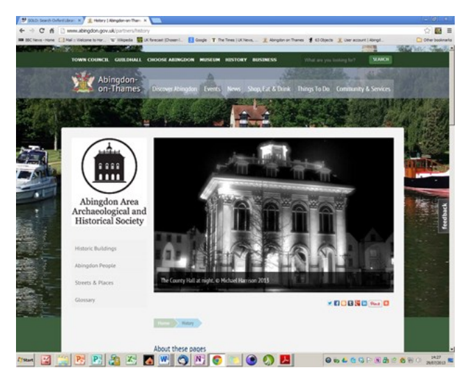
Find www.Abingdon.gov.uk and click on 'history' and this is what you will get.

Setting up a big new website is not easy, and the eight-person group was hard put to it to provide the material for a first fill to the quality standard it set itself and in the short time available. We were fortunate in having overlapping membership with the Oxfordshire Buildings Record and access to their extensive archive on Abingdon buildings. In the event, we opened with forty-two articles instead of the thirty we had promised, and, unlike some of the professional contributors, met all the deadlines.