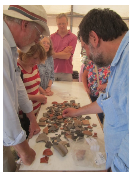
... and the finds.

Finds have included numerous animal bones thought to be the usual domestic type of animal waste rather than any intensive farming type of usage, much pre-Flavian