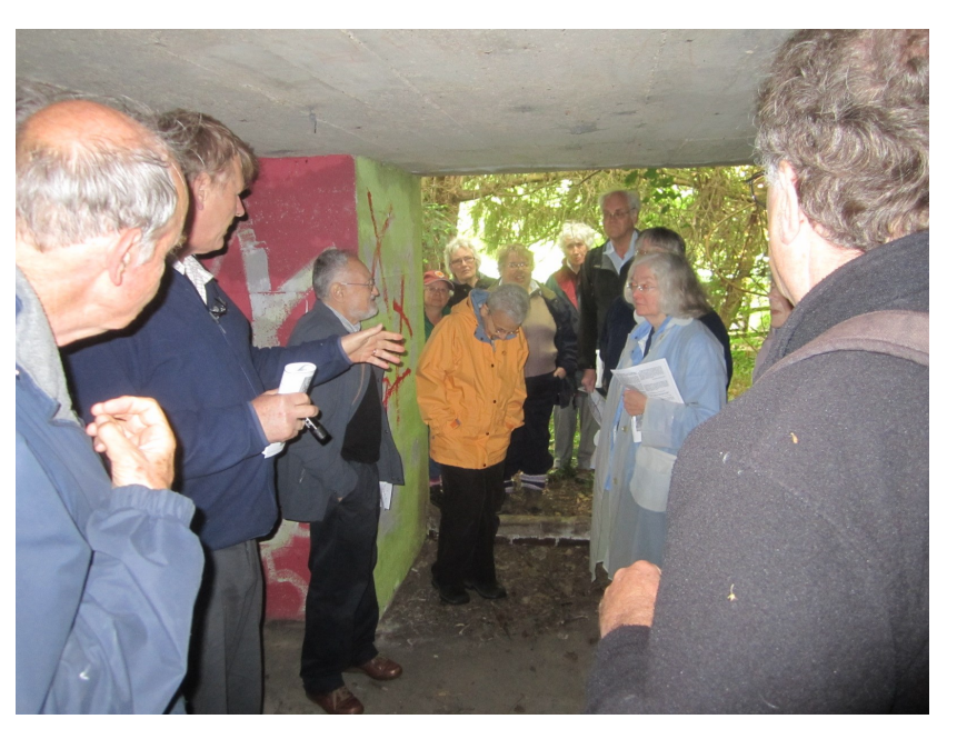
How many AAAHS members will fit into a 2-pounder pillbox?

comprising 250 tons of reinforced concrete, was designed to house a twopounder anti-tank gun and crew. The smaller Type 24 was for typically eight infantry armed with rifles and light machine guns. We visited two of each type. The main line of defence was to be the River Thames, but the salient between Newbridge (north of Kingston Bagpuize) and Abingdon was protected by an anti-tank ditch, typically 20 ft wide and 8 ft deep, reinforced by pill